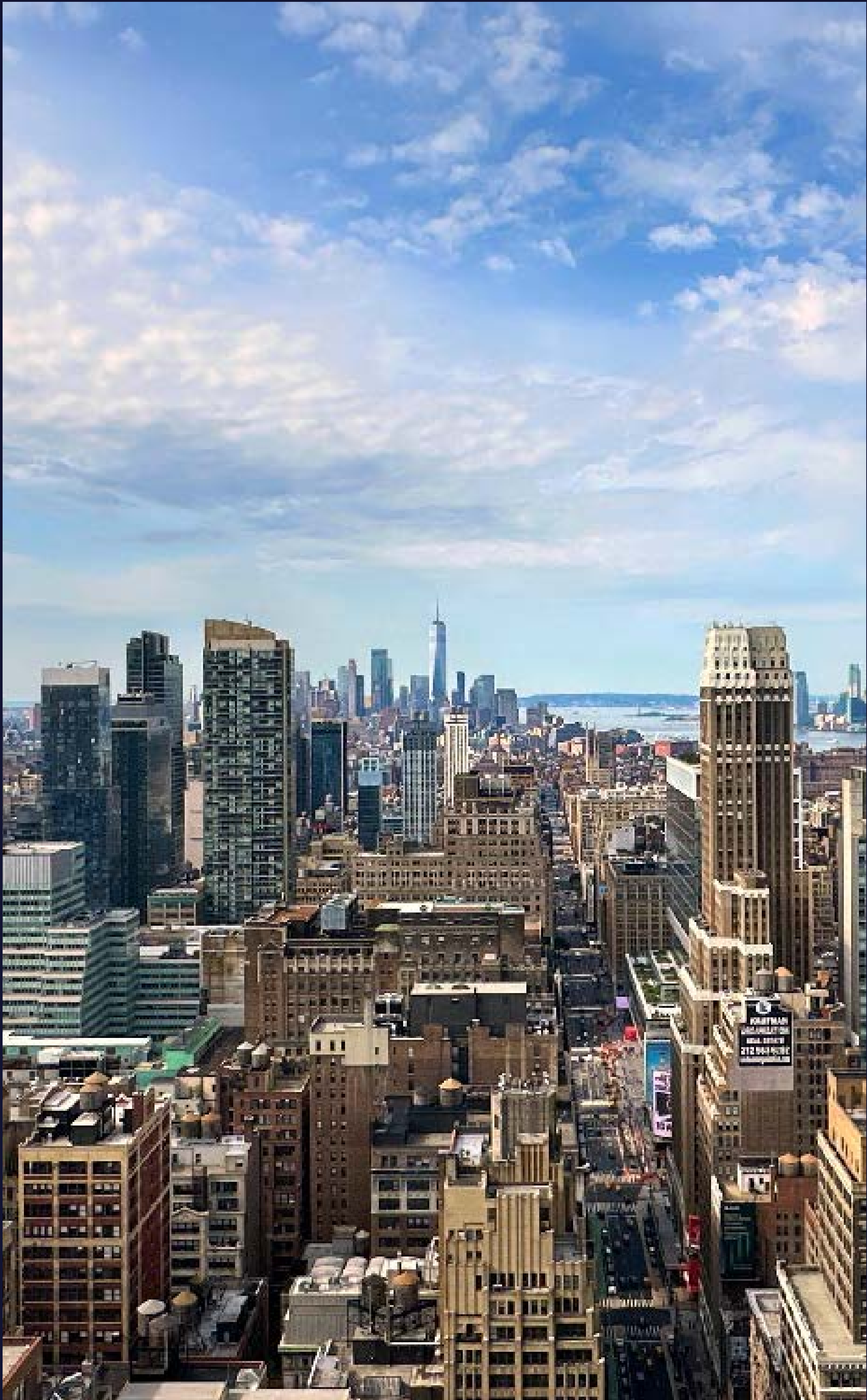
VIEWS TOWARDS DOWNTOWN