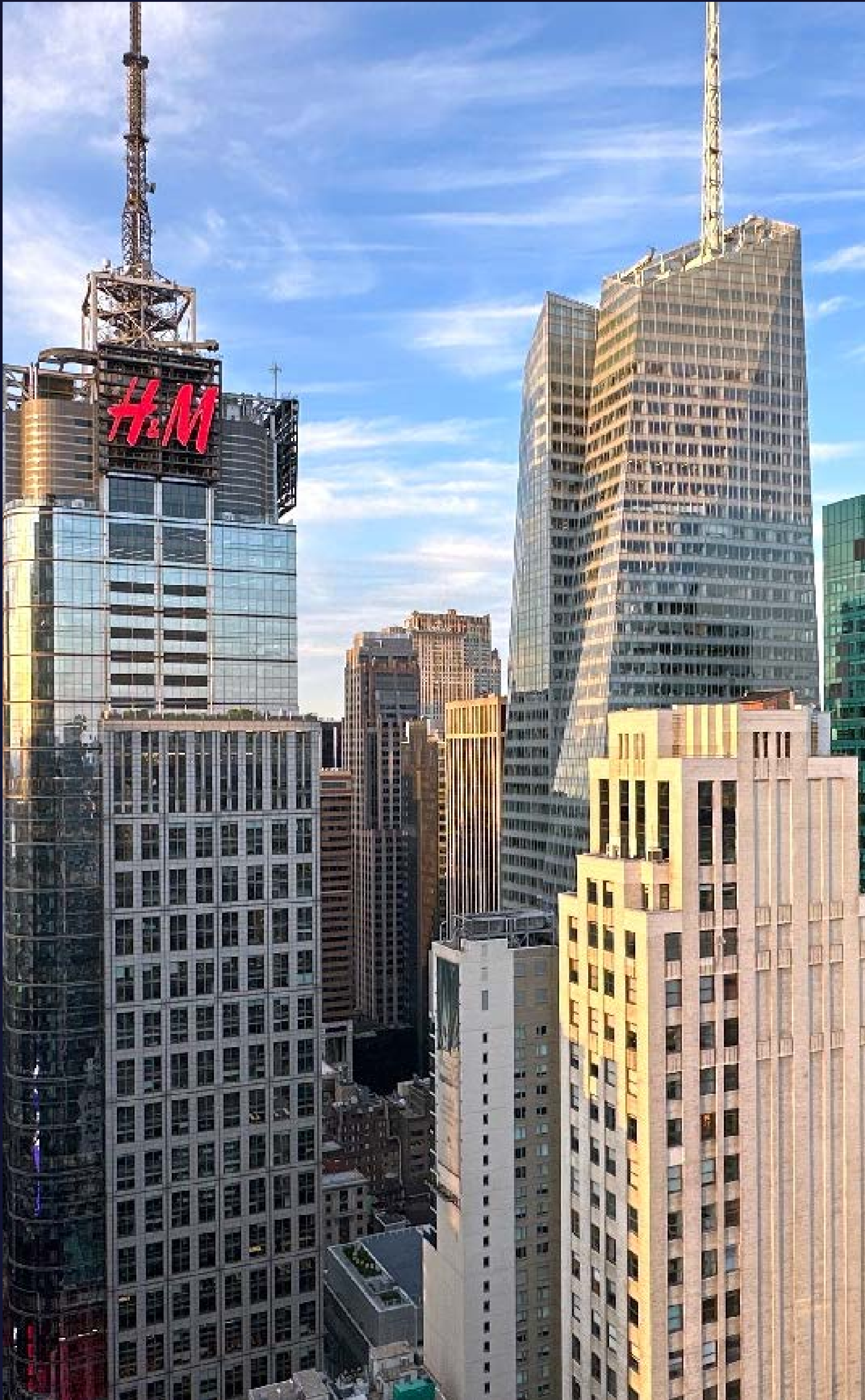
VIEWS TOWARDS MIDTOWN