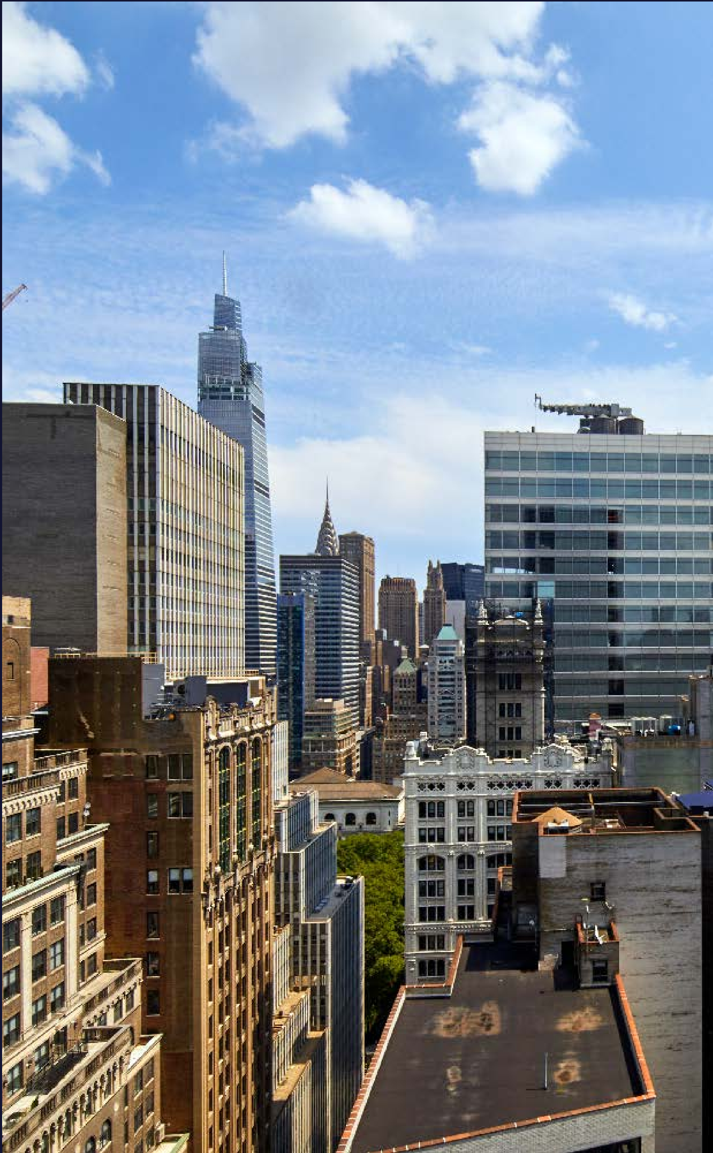
VIEWS TOWARDS THE EAST