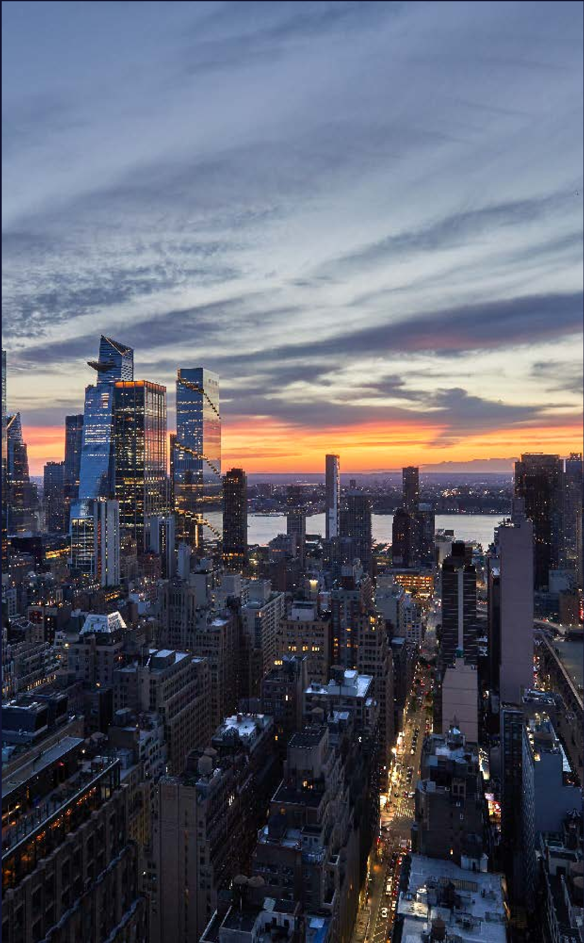
VIEWS TOWARDS HUDSON YARDS